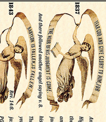
And the 3rd angel followed them with a loud voice saying.

with a LOUD VOICE, everlasting gospel to preach to every nation, tongue, and people. Saying in the midst of heaven, having the